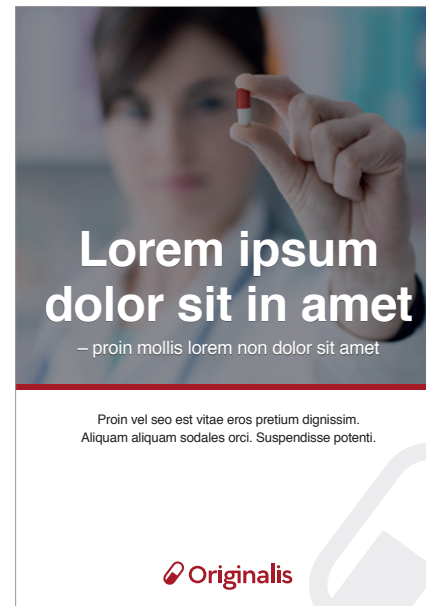
Example of logo placement on a A5 flyer